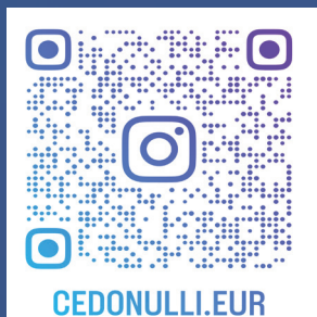
OUR INSTAGRAM PAGE

SCAN THE QR-CODES AND YOU'RE ALL SET FOR THIS YEAR